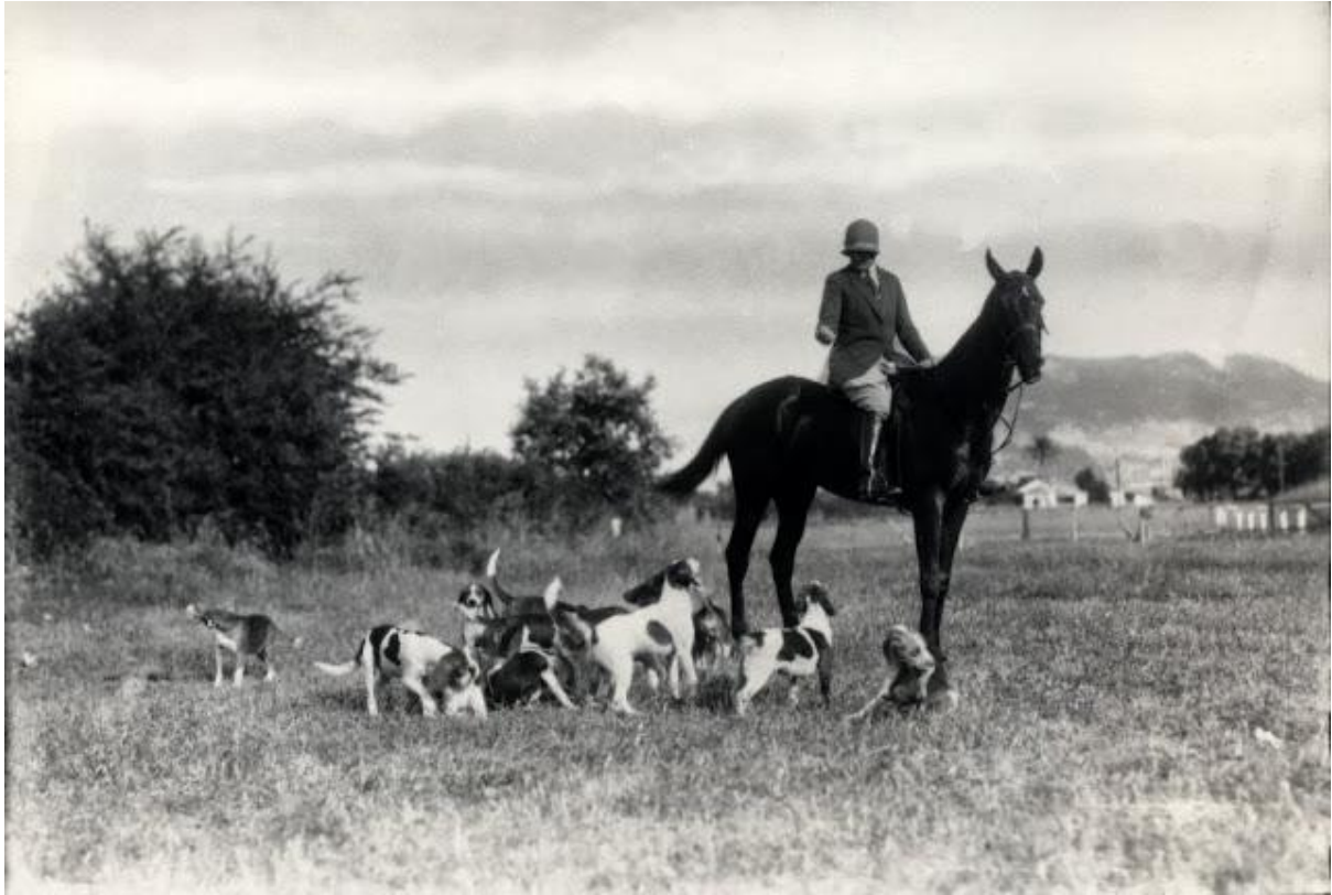
Forever England with The Rock in the background

As such, and despite his right wing views, I think we should be proud to call him a Gibraltarian. I know I am.