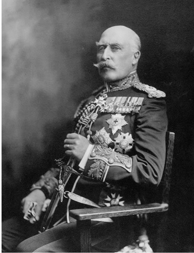
The Duke of Connaught