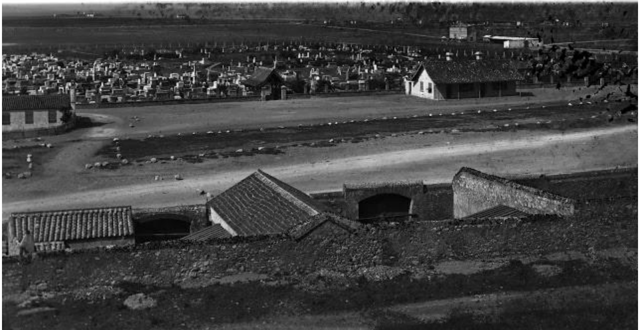
The Catholic cemetery at North Front - The Larios vault is somewhere in there

It was the end of the family's long and important connection with Gibraltar