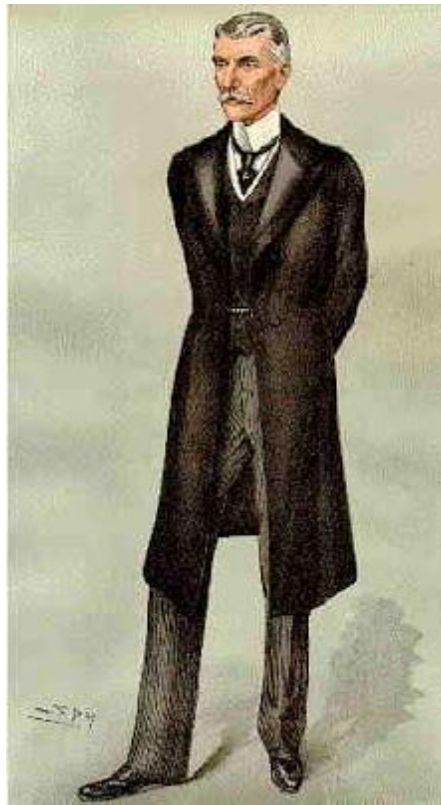
Sir Frederick Forrestier-Walker ( 1902 - Vanity Fair )