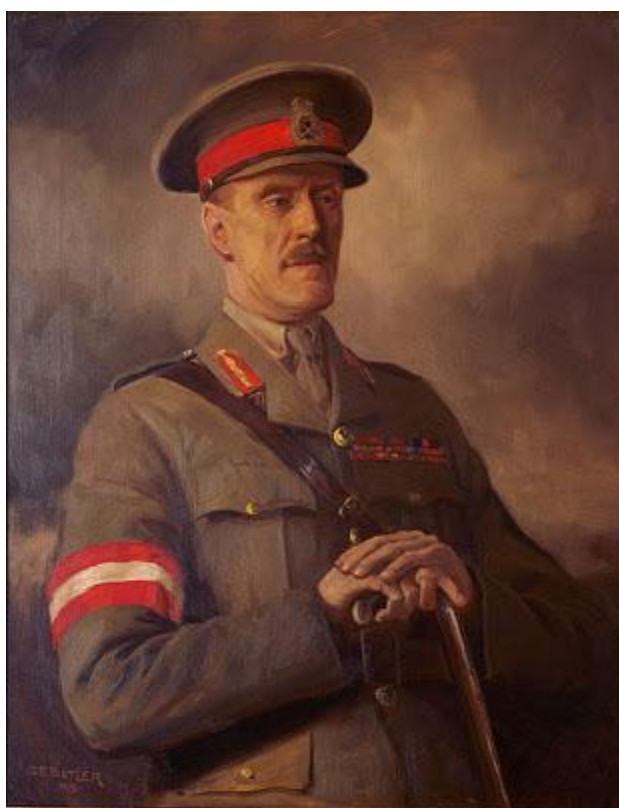
General Sir Alexander Godley, Governor of Gibraltar