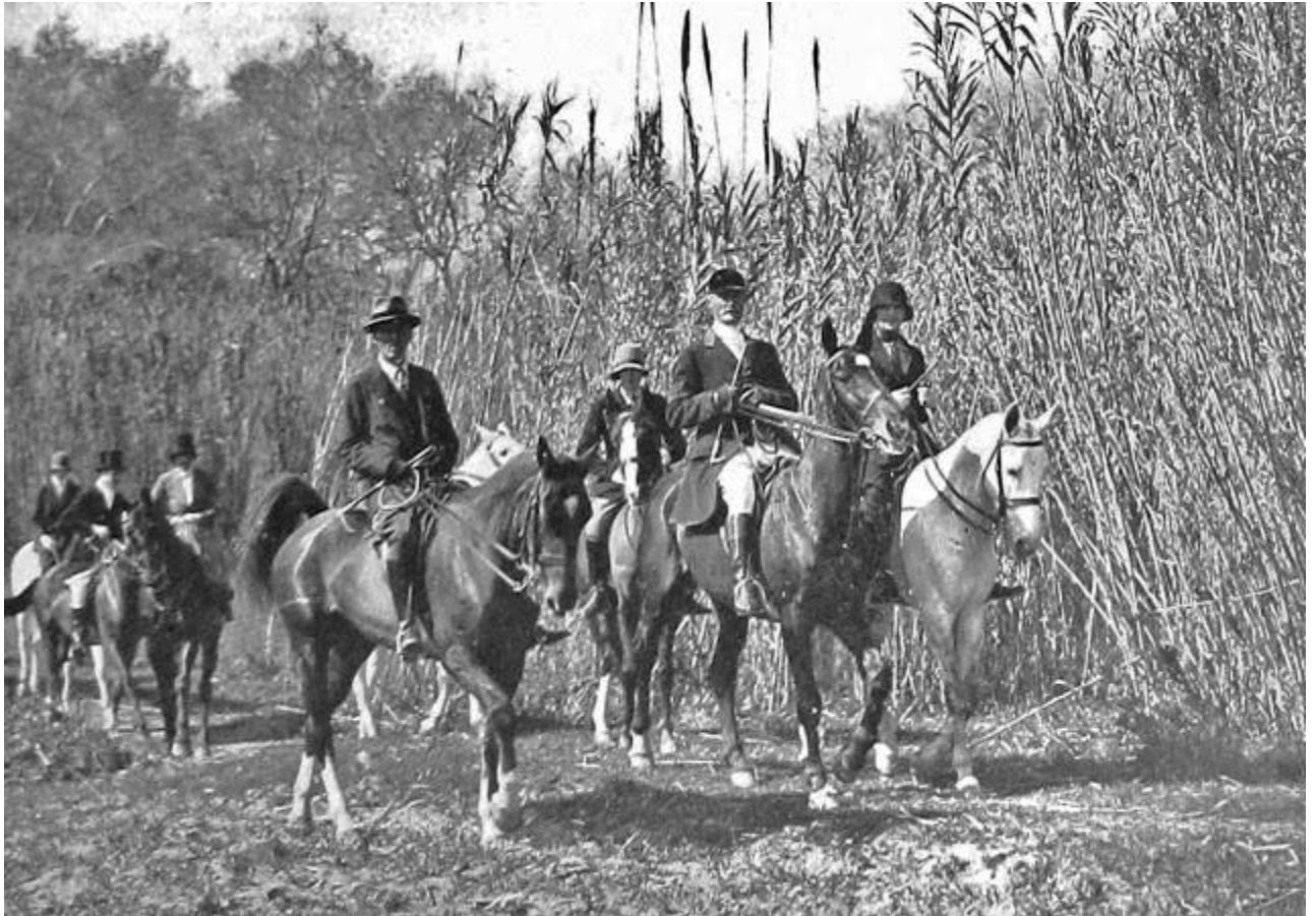
Another photograph of the Hunt. The fellow on the left is General S.E.B. Seely , the first Baron Mottistone. He had only recently resigned from his post as Secretary of State for War no less.