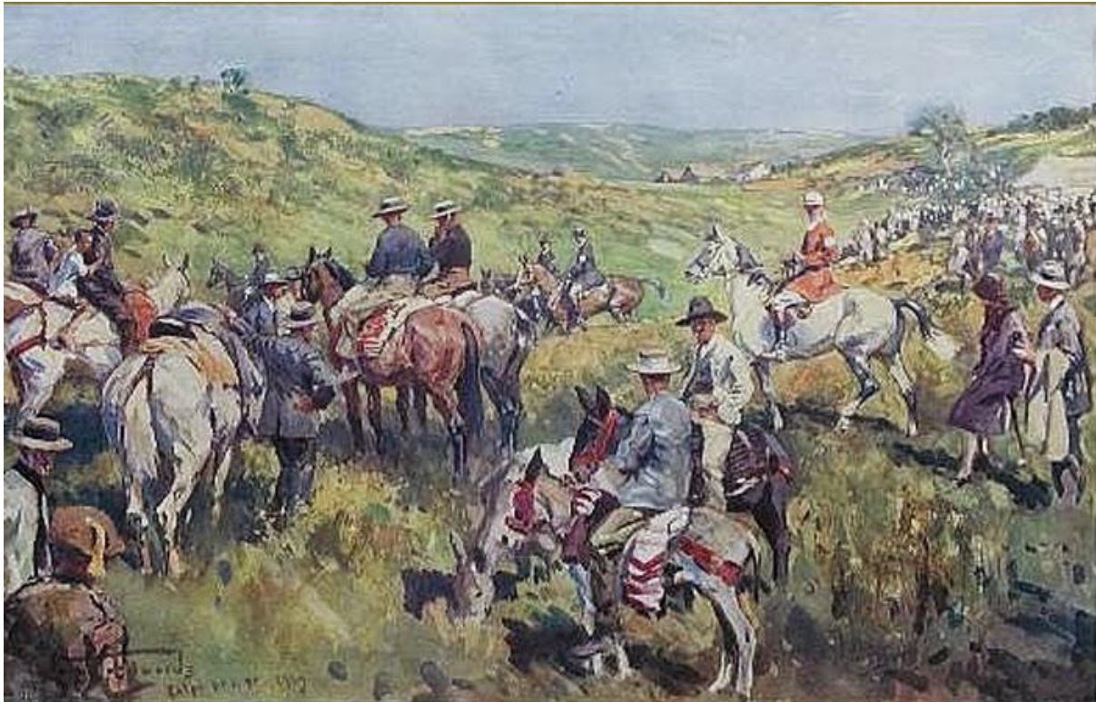
The Point to Point